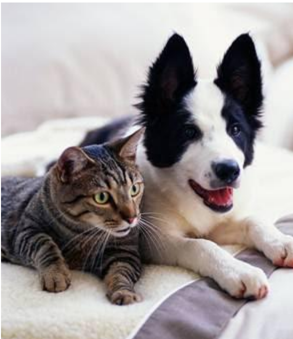
PETS MAKE WONDERFUL HOSTS FOR FLEAS